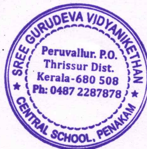
SECRETARY Sree Gurudeva Vidyanikethan Central School, Penakam Peruvallur P.O; Thrissur-680508 Phone: 0487 2287878